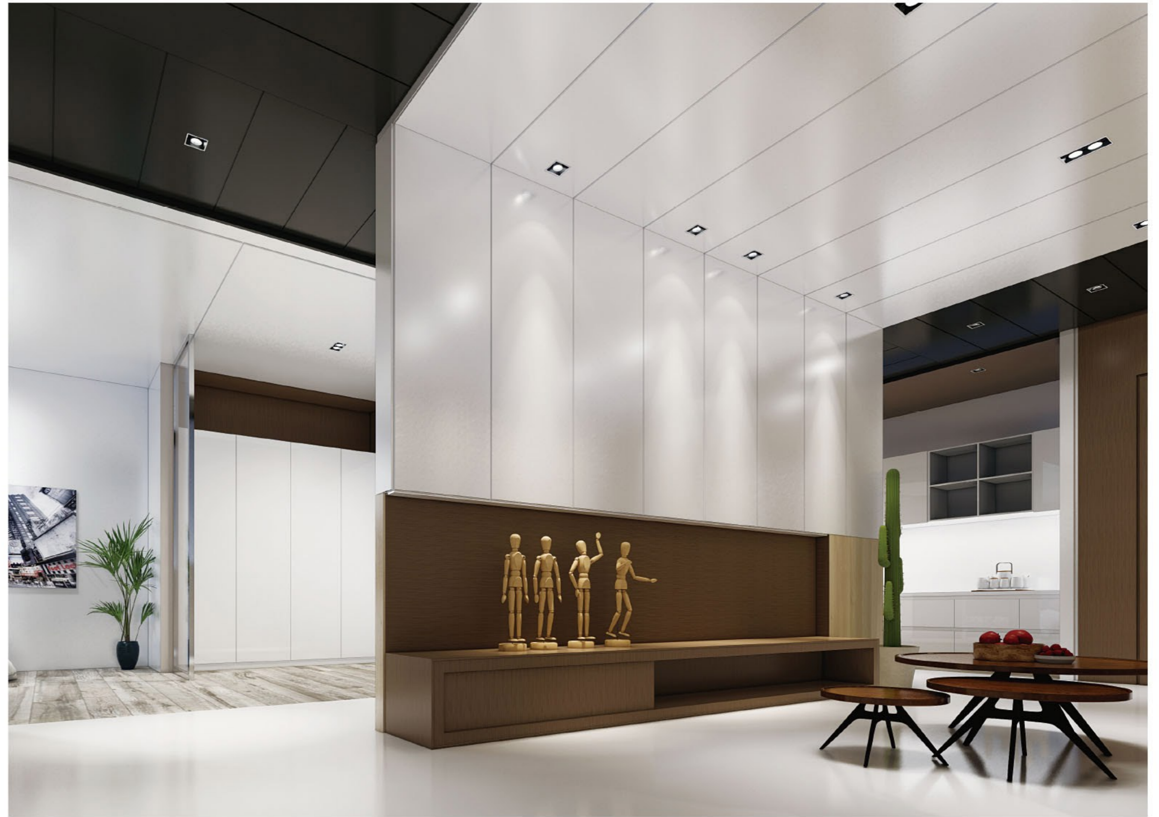
Foshan Apartment Hall / 佛山公寓大厅